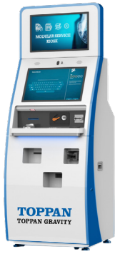
THERMAL PRINTING CAPABLE