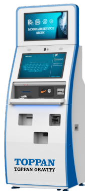
THERMAL PRINTING CAPABLE